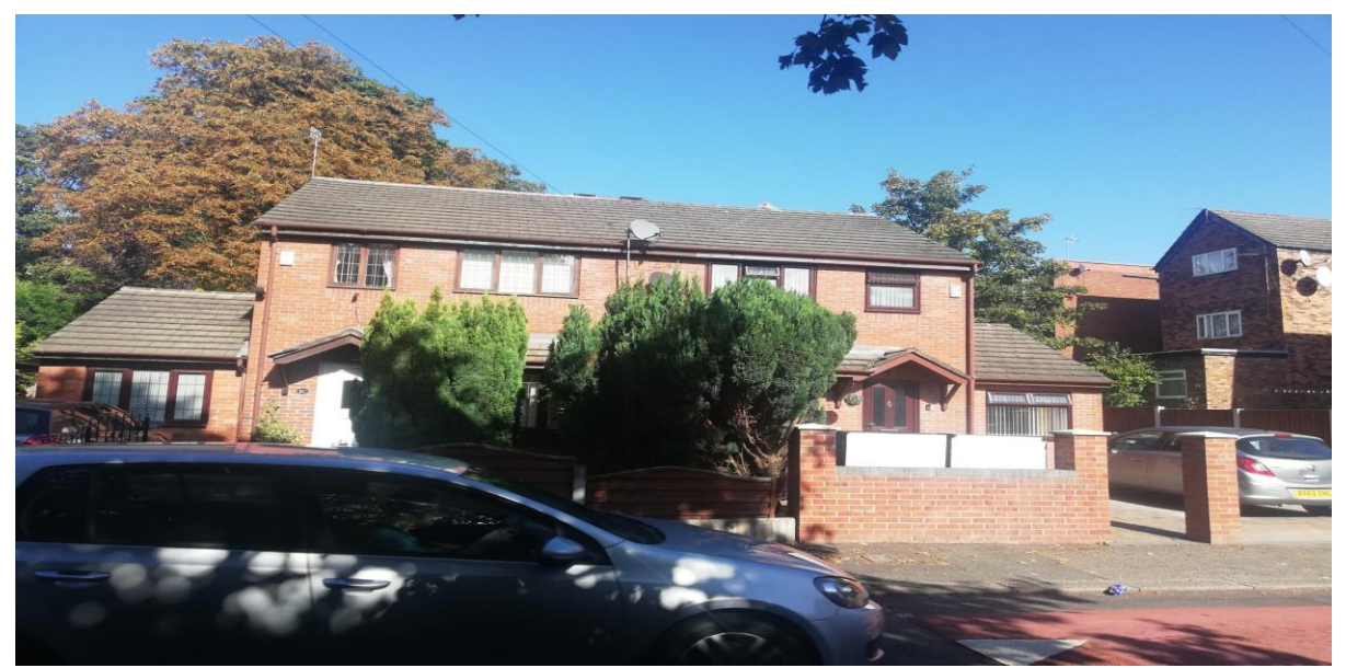
(Image 4) The application site viewed in conjunction with properties on Holland Road.

(Image 3) Building at the Junction of Middleton Road and Ardern Road south west of the site.